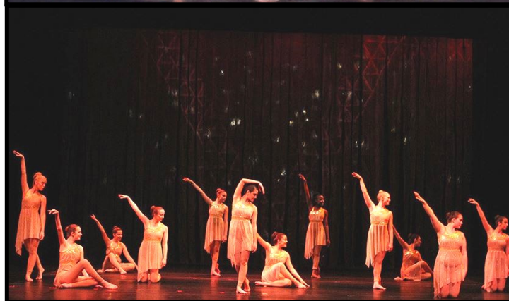
All Photographs are students trained by Kate.